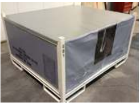
Boxes & containers

Create a digital twin of your most important assets, including: